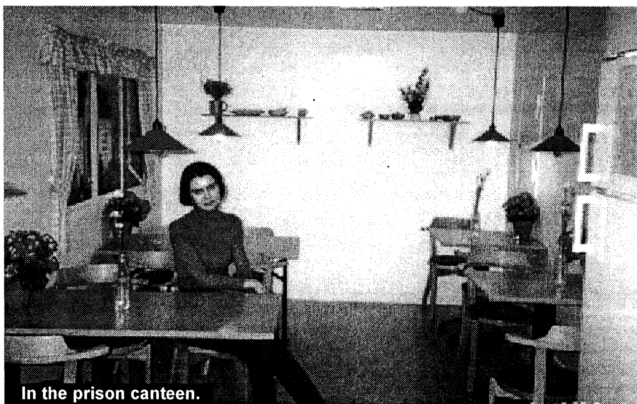
In the prison canteen.

The hall of the Swedish II doesn't at all resemble a prison corridor with the exhausted, uneasy prisoners who stand in queues in order to receive parcels from their relatives, have a meeting with them or the prison officials. Prison servants meet us with the smiles similar to those one can see on faces of the girls who work as hotel receptionists. In a minute we are turning up to the ninth floor in a lift cabin. There the special department where the visitors meet with