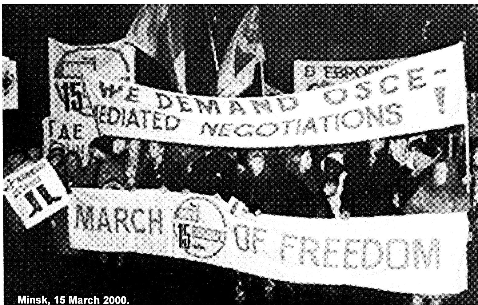
Minsk, 15 March 2000.