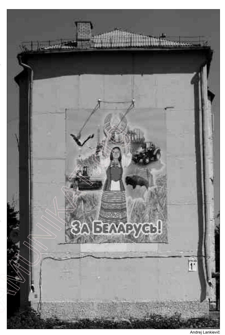
"Za Biełaruś!" – "For Belarus!" was the main slogan of Łukašenka's campaign.

The role of the Soviet Union has been hyperbolized and promoted in many spheres from state symbols to movies. With this purpose in mind, the authorities rebuilt the "Stalin Line" of World War II fortifications and celebrate