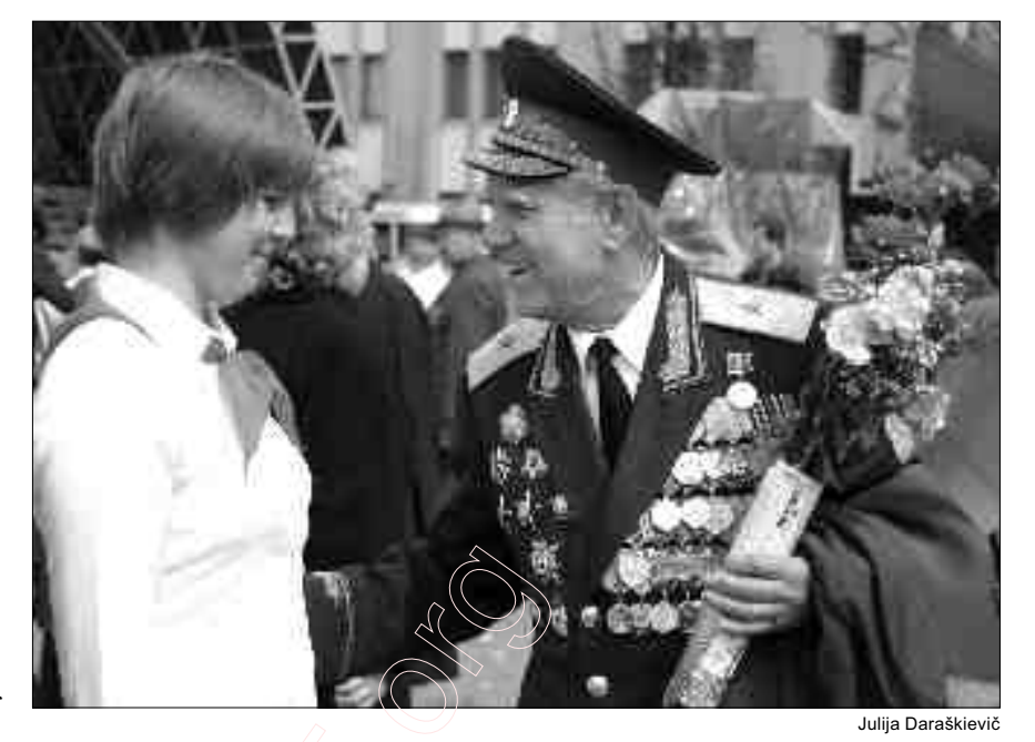
A veteran and a pioneer.

All propaganda means are employed to emphasize an alleged great role of the president in the country's history and stress that modern Belarus would not exist without him. The ideology is based on the absurd premise that the state, the people and society would not be able to function properly without the "strong arm" or