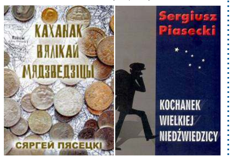
Cover of the book by Sergiusz Piasecki in Belarusian and Polish

Mr Yanushkevich glances pensively through the window onto the empty market place. I look in the same direction and just for a second the village street gives way to a bustling bazaar with merry merchants and traders, mademoiselles looking for new wardrobes, and mysterious clandestinelooking gentlemen hurrying through the happy crowds. It lasts just a second, and then the vision is over, dissolved by the pale rays of the winter sun.