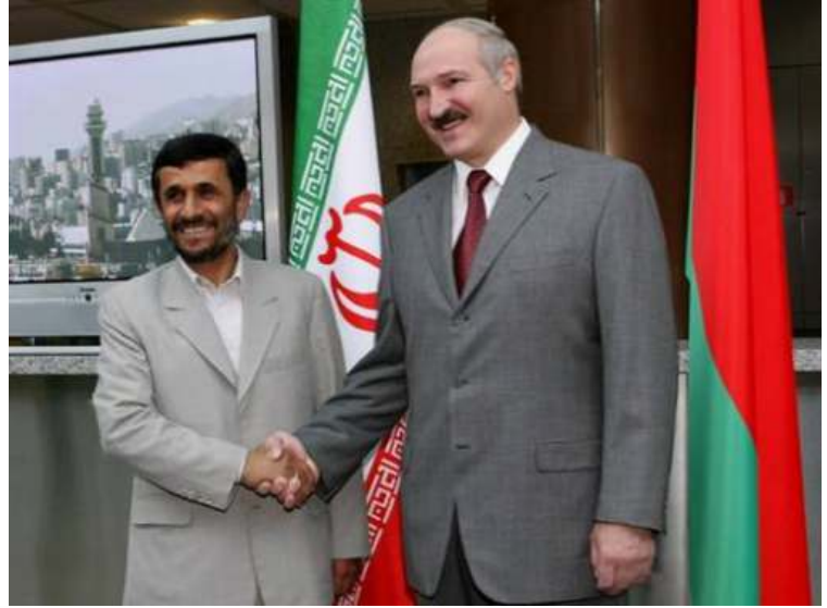
Mahmoud Ahmadinejad in Minsk (2007).

The Iranian regime also used new contacts with Belarus in its propaganda – as a demonstration of a "breakthrough to a new European market." Iranian progovernment media devoted significant attention to projects, visits and exhibitions in Minsk. The negative aspects were omitted – even the opposition Iranian media this February failed to notice the statement by the Belarusian Deputy Prime