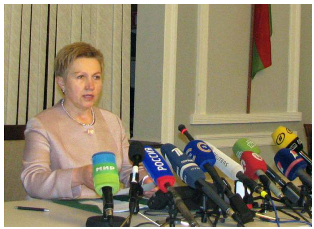
Belarus Central Bank Chief Nadzeya Ermakova at the press-conference where she announced the Devaluation of the national currency. 20 October 2011, Minsk.