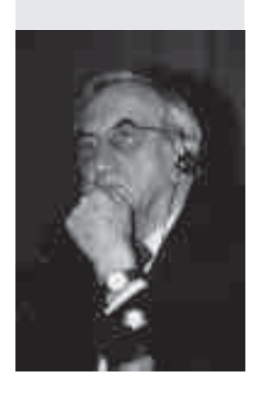
Tadeusz Mazowiecki former Prime Minister of Poland, Warsaw