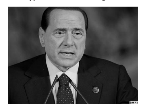
Italian PM Silvio Berlusconi

Berlusconi stopped short of mentioning Belarus's ties with the