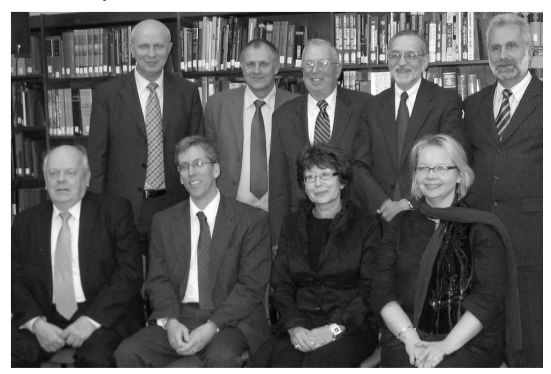
Participants of the symposium

The Center for Belarusian Studies at Southwestern College organized and held a major symposium October 6 and 7, 2009 , on the topic "Higher Education and Civil Society in Belarus." The conference - held on Southwestern's campus in Winfield, Kansas - brought together leading specialists in the subject area from Belarus, from the North America Belarusian Diaspora, and from the diplomatic arena.