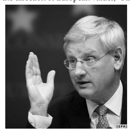
Sweden's Foreign Minister Carl Bildt

"We have prolonged the sanctions, but we have suspended their application. That is, we are still in a period of engaging with authorities in Belarus to try to move them further in the direction of European values," Bildt said.