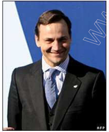
According to a source of the Polish newspaper Rzeczpospolita in the Polish Foreign Minsitry, the country's

Foreign Minister Radoslaw Sikorski plans to visit Belarus in early November 2010.