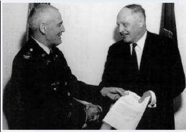
While working in Washington