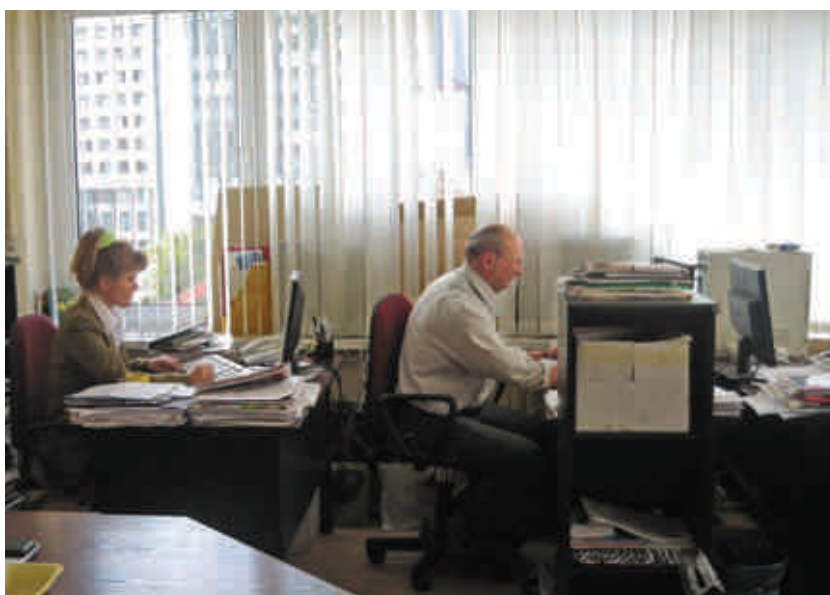
Journalists at work at the newspaper Belarusians and Market in Minsk.

Chapter 9 of the law outlines the liability of media for violating media legislation. The first step is a written warning to editors, which can be based on a number of reasons including "disseminating inaccurate information that might cause harm to state and public interests" and "distribution of information not complying with reality and defaming the honour or business reputation of individuals or the business reputation of legal entities" (Article 49, paragraph 1). Following this, the Ministry of Information can suspend the operations of media for three months for a number of reasons, including for failing to provide information on remedying offences with the necessary evidence (Article 50 paragraph 1). The last sanction that can be applied is for a court to terminate the activities of a media outlet (Article 51), including that the founders of that media would be restricted from starting a new outlet for three years (Article 10 paragraph 3.3) 20 .