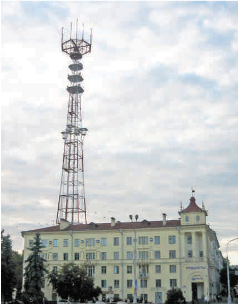
Antenna in Minsk.

The below presented text analyses the principles of the allocation of broadcast frequencies and licenses in the Republic of Belarus as well as the setting and the functioning of the body, empowered to allocate these frequencies and licences for compliance with good practices and international standards. The purpose of this analysis is to provide an expert opinion as well as some recommendations.