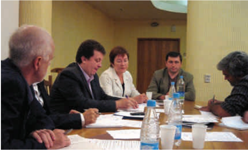
BAJ top leaders in meeting with the International Media Mission to Belarus, September 2009.

According to the Federation of Trade Unions of Belarus, 94.1% of the economically active population of the country is affiliated to a trade union and the working relations of 97% of workers in enterprises, organisations and other institutions are regulated by means of collective agreements.