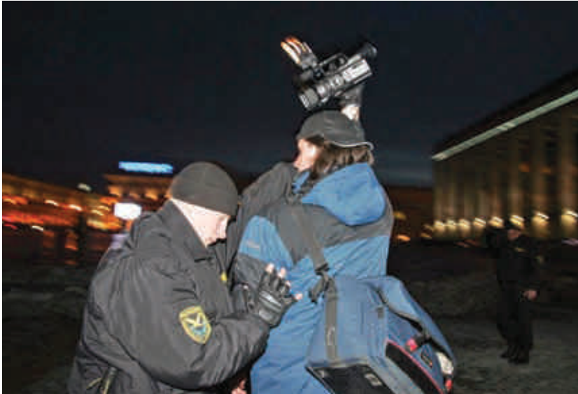
A special police officer tries to prevent a TV cameraman from filming a street action of protest after the presidential elections of 2006.

When the Belarus government engages with the media, it routinely uses the language of war. Speaking at the Belarusian State University in February 2008 President Lukashenko clearly stated that he considers sectors of the media beyond his direct authority a direct threat. "Media hold a weapon of a most destructive power," Lukashenko told a group of journalism students at the university, "They must be controlled by the state."