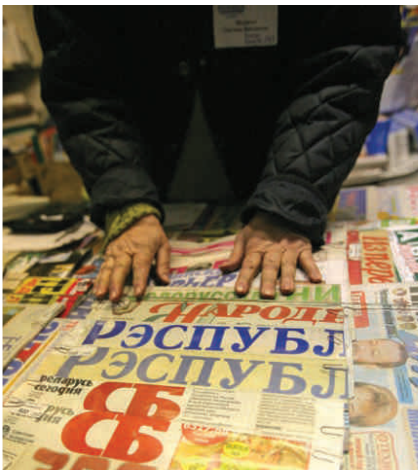
News kiosk in Minsk.

This is especially problematic when it comes to access to information which is largely restricted for the non-state media via the so-called ideological departments. These departments cut across the entire public administration in the country. Thus, since most independent media cannot access information of vital public interest, the public at large remains deprived of knowledge about important societal matters and decisions of the authorities and administrative bodies. The media in Belarus cannot under the present circumstances function fully in accordance with their role as "a watchdog of government in all its forms, promoting transparency in public life and public scrutiny of those with power through exposing corruption, maladministration and corporate wrongdoing." 3