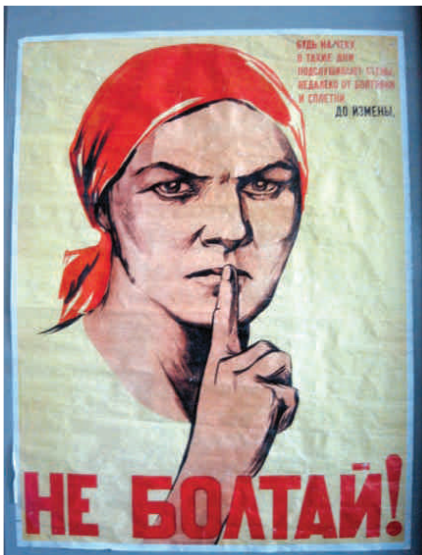
Poster cautioning "Don't tell!" in Russian.

On 15 July 2008, amendments to the Law "On state service in the Republic of Belarus" were adopted. In particular, the law was complemented by Article 22-1, according to which all statements to the press of officials at any level, should be authorised by the chief of their state institution or by a person authorised by the chief.