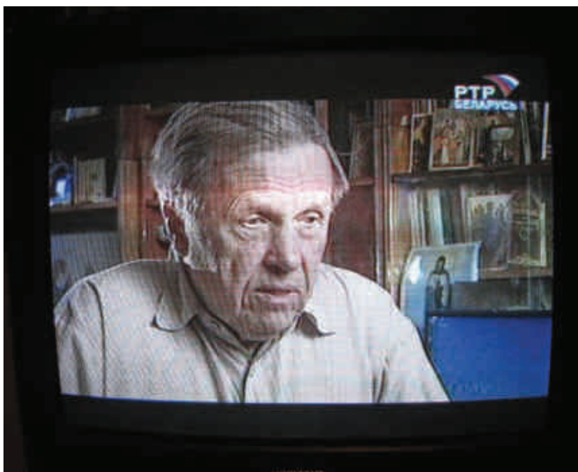
Photo by Jane Møller Larsen/ IMS. State-controlled TV channel in Belarus.

According to the above mentioned decrees and regulations the Commission (which is the sole and only regulator of both, the broadcasting sector and the process of the allocation of licences and frequencies) is founded not by the law adopted by the Parliament, but by the decree of the Council of Ministers. The latter together with the Ministry of Information appoints all the members of the Commission, including the chairman, who ex officio is the Minister of Information. Thus the Council of Ministers and the Ministry of Information are in full control of the process of allocation of all frequencies and licences. Decrees and regulation does not contain the reference to the inclusion of civil