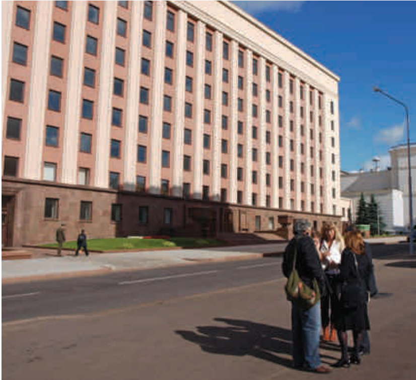
International Media mission in front of the Presidential Administration in Minsk.

Based on the knowledge and expertise of the participating organisations in reference to international media standards, the purpose of the mission was to undertake an assessment of the present media environment and freedom of expression situation in Belarus. In the same light, the purpose of the present report is to ensure that press freedom and media reform remain at the heart of the on-going negotiations between the European Union (EU) and the Belarusian government – both in regard to the current suspension of certain EU sanctions against Belarus, the longer term Eastern Partnership Initiative and the Human Rights Dialogue (elaborated on below). A first meeting between some of the organisations of the mission and the Direction General E, Directorate Western Balkans, Eastern Europe and Central Asia, Council of the European Union , was held in Brussels on 1 April 2009. Subsequently, updates on the media situation in Belarus were sent to the European Council by the group of organisations involved. 2