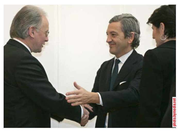
This week Miensk is full of European visitors, Narodnaja Vola reports.

On Monday, a delegation of the Parliamentary Assembly of the Council of Europe arrived in Belarus. During three days the representatives of PACE intend to discuss prospects of a further dialogue in the field of democracy and human rights with Belarusian authorities. Meetings are scheduled with officials – chairpersons of both chambers of the National Assembly, the Prosecutor-General, chairpersons of the Supreme and Constitutional Courts, in the Ministry of Foreign Affairs and the Presidential Administration, as well as with representatives of opposition.