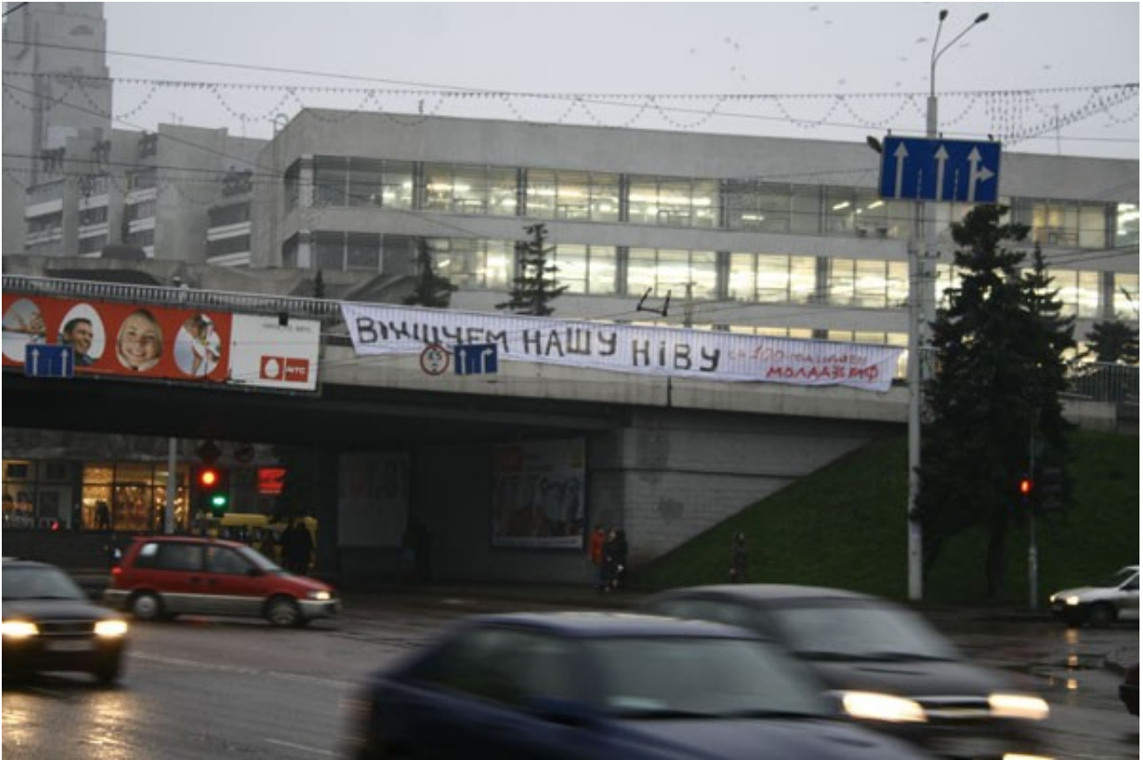
Belarusian government has forgotten about centennial of the first Belarusian newspaper "Naša Niva". BNF (BPF) Youth activists hung out a congratulatory banner in the center of Minsk.